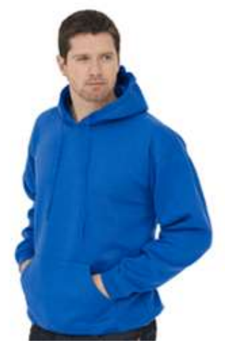
UC501 Hooded sweatshirt