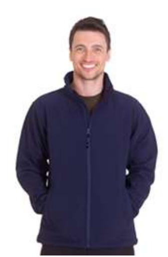
UC612 Classic soft-shell jacket 3-layer waterproof/breathable 2 zip outside pockets