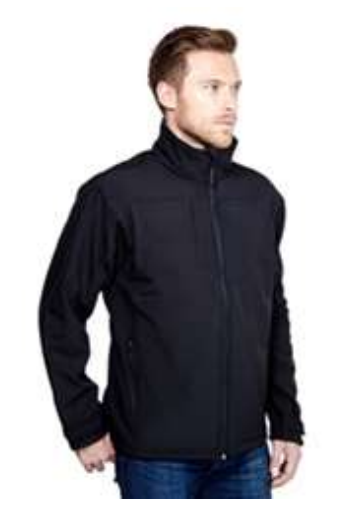
UC611 Premium soft-shell jacket 3-layer waterproof/breathable 3 zip outside & 1 inside pockets