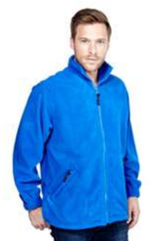
UC601 Premium Fleece UC603 Children's Fleece