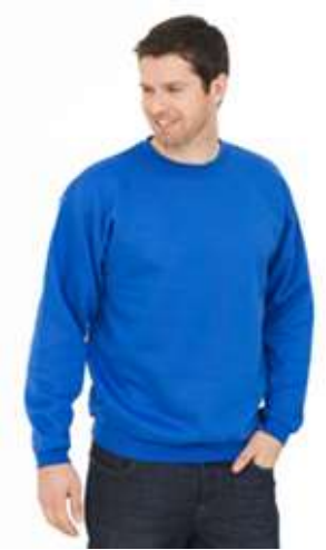
UC201 Premium Sweatshirt UC203 Children's Sweatshirt