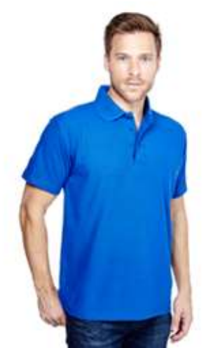
UC101 Classic Polo shirt UC103 Children's Polo shirt