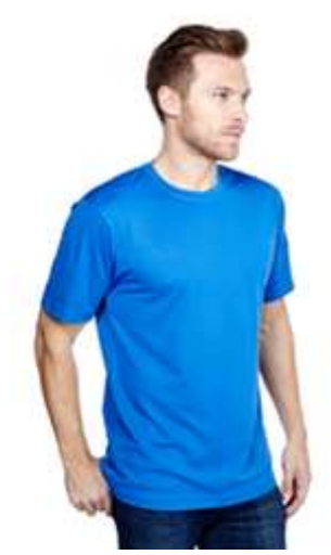
UC302 Premium Tee shirt UC103 Children's Tee shirt