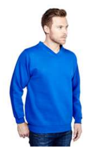
UC204 Vee-neck sweatshirt