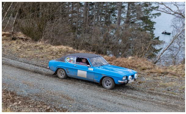
Regularities all done we now had a longish road section back from Tobermory through Salen to get to the final loop of tests which started at Balmeanach with a run up through the forest