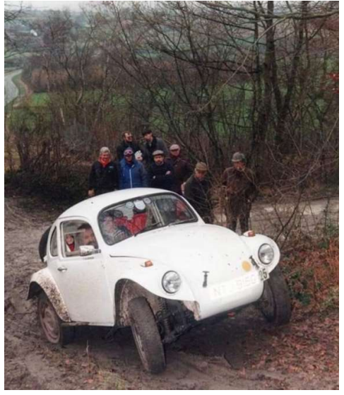
David's cut-and-shut short-wheelbase VW competing while in previous ownership

David wrote a series of articles about the major classic trials for 'Spotlight' and the following sections have been extracted from the articles he wrote in 2009.