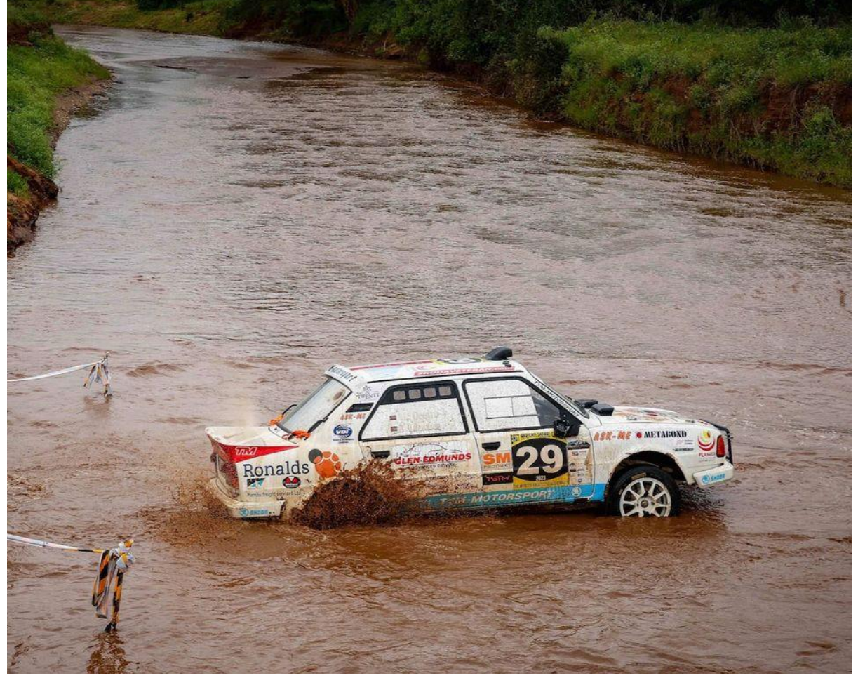
We never had to cross a Ford like this with our home built. Championship-winning Skoda 130L

Here is the first newsletter of 2024 for The Sporting Car Club of Norfolk